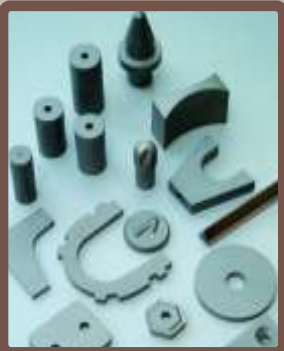
shapes according to customer drawings