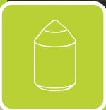
drawing dies, special tools and rings